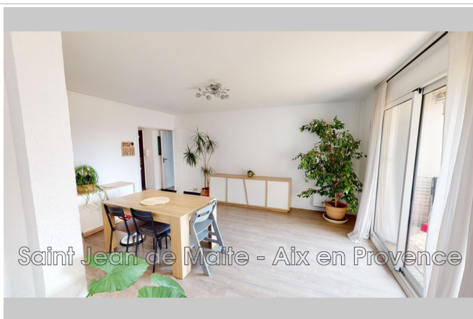
Saint Jean de Malte - Aix en Provence