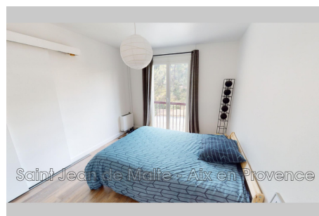
Saint Jean de Malte - Aix en Provence